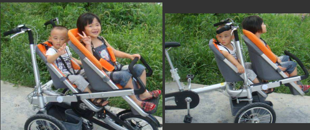
double seat for twins, coming soon