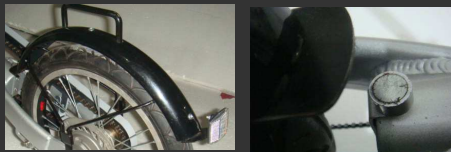
m. strolling fender with reflector mounting on magnet