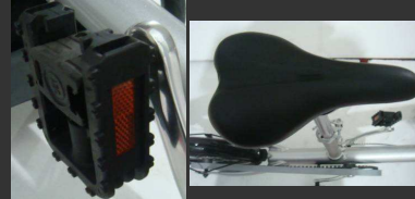
j. foldable pedal and adjustable driver seat