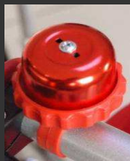
k. bell in any color