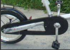
i. full chain cover in black