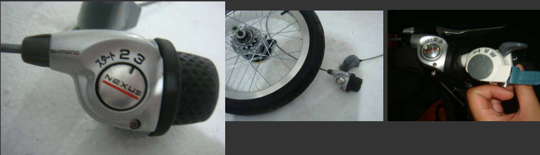
SHIMANO 3-GEAR SHIT